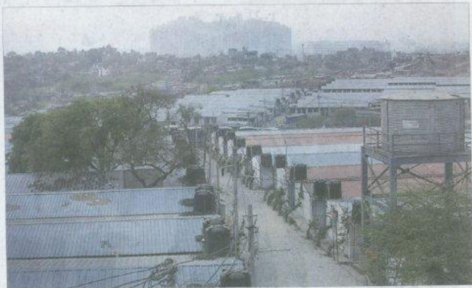
The transit camp at Anand Parbat. (Below) A resident of Kathputli Colony.

Kathputli Colony, a slum cluster near Shaheed Jai Prakash Singh Park, is home to hundreds of artists, who have represented India in several fairs and festivals abroad since independence. Magicians, acrobats, mime artists, puppeteers, jugglers, folk singers, snake charmers, bear handlers, monkey trainers and other street performers reside in the colony.